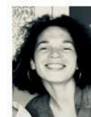
Véro Co-founder Public subsidies & DRC