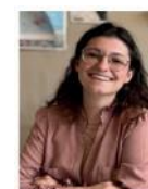
Lara Events & awareness